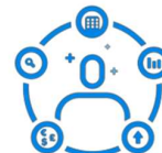
Business Process Outsourcing

If you are tired of dealing with the payroll industry dinosaurs and their outdated and inflexible technology, or with aggregators who simply pass on your data to their subcontractors and divert your calls to an off-shore call center and never seem to have the local knowledge, Mercans is your ideal partner.